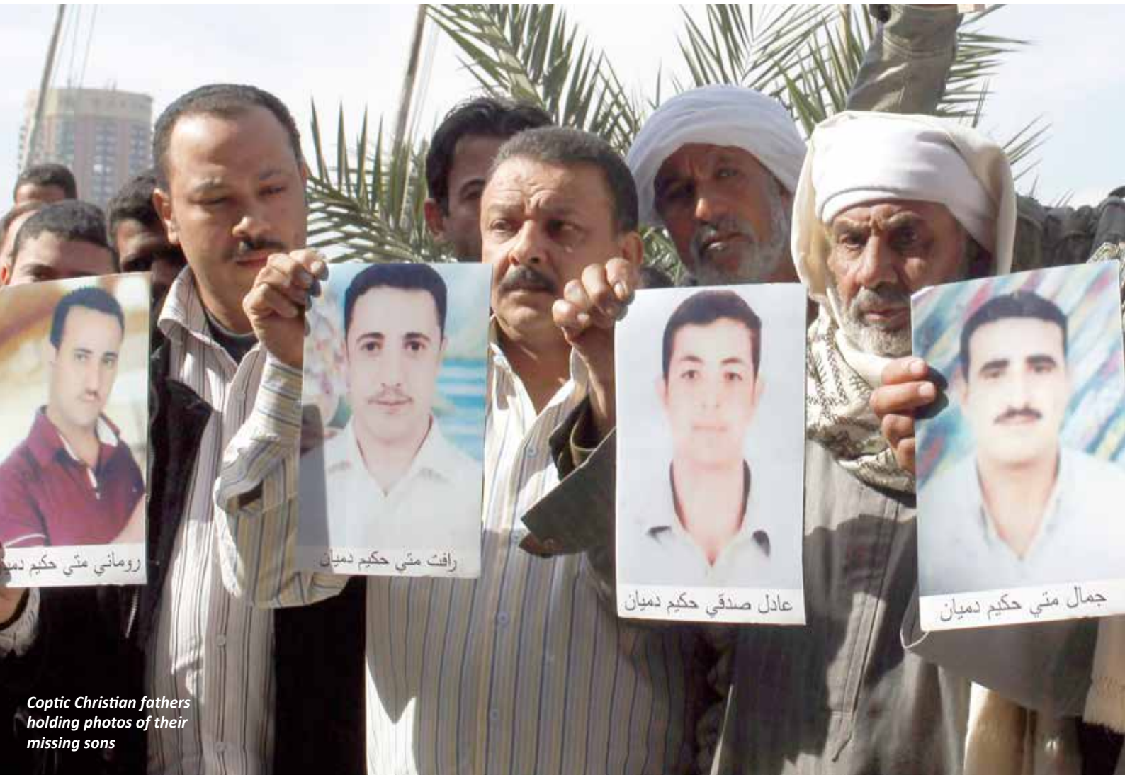
Coptic Christian fathers holding photos of their missing sons

Recently Margaret Court, one of the greatest female